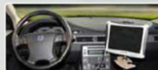
■ STMC - PANASONIC CF19 INSTALLED IN A SARSYS FRICTION TESTER, SVFT