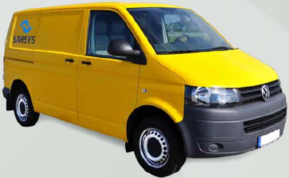
■ SARSYS FRICTION TESTER TRANSPORTER

The entire measuring system is contained within the van with unchanged driving qualities and without need to hook up a trailer.