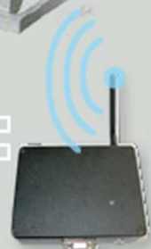
■ WIRELESS BRIDGE

The hardware of the measuring computer is a rugged laptop with touchscreen function and a wireless bridge for communication to the trailer thru a peer to peer connection. The preamplifier is fitted in the box for the electrical equipment on the trailer.