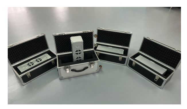
Figure 2 Mass-produced Cubesat Test PODs - MyPOD (R).